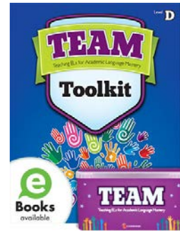
TEAM Toolkits: Teaching ELs for Academic Language Mastery