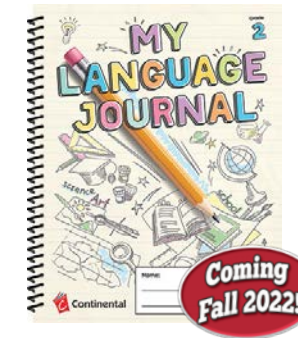
My Language Journal