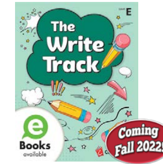
The Write Track for English Learners