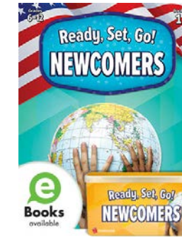
Ready, Set, Go! Newcomers Kit