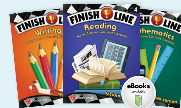
Finish Line for the CCSS, Second Edition