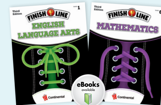
Finish Line, Third Edition