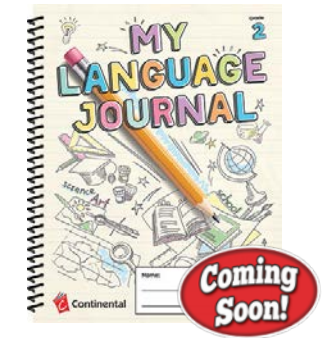
My Language Journal Grades K–12