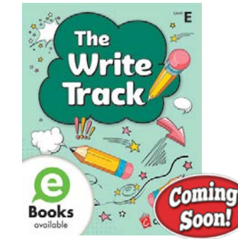
The Write Track for English Learners Grades K–12