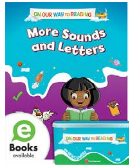
On Our Way to Reading— Newcomers Grades PreK–3