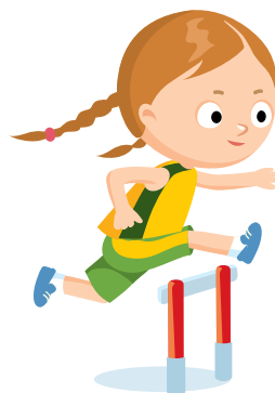
track and field