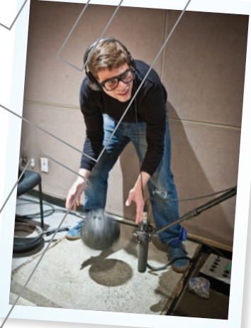
Foley artist at work

Design sound effects are sounds that do not occur in nature. Therefore, they must be interpreted and created by the sound artist. Design sound effects are common in science fiction movies with futuristic technology.