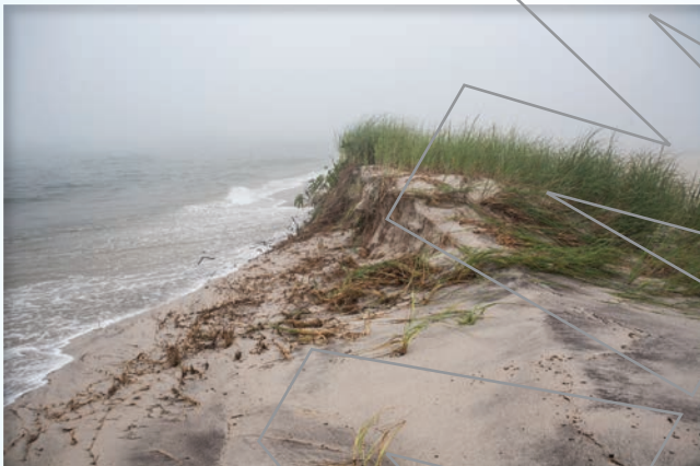
Crashing of Waves

Background sound effects are not as specific as hard sound effects. They are used in a more general way to suggest the setting to the audience. Audiences expect to hear the crashing of waves at the beach or the chirping of birds in an outdoor meadow. Effective background noises establish the ambience of the movie and set the emotional mood.