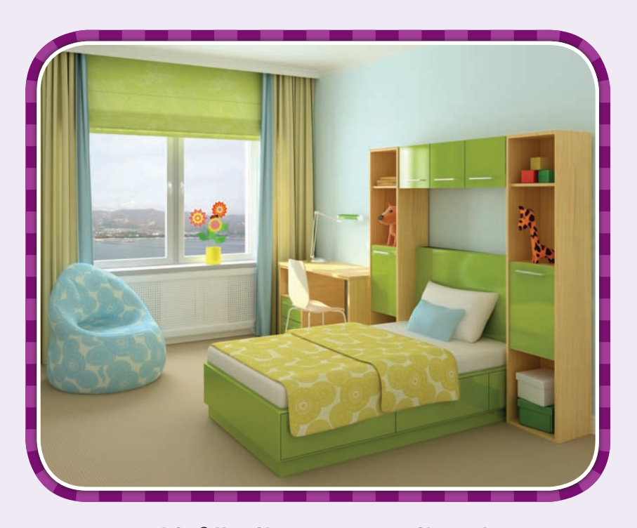
Light fills this room with color.

You can see more colors when a room is light.