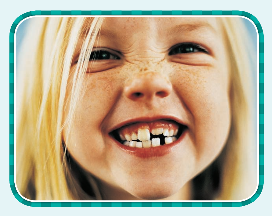
New teeth grow in place of the baby teeth.

When you lose a tooth, there is a space in your smile. Soon a new tooth grows in its place.