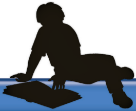
Table of Contents Level D