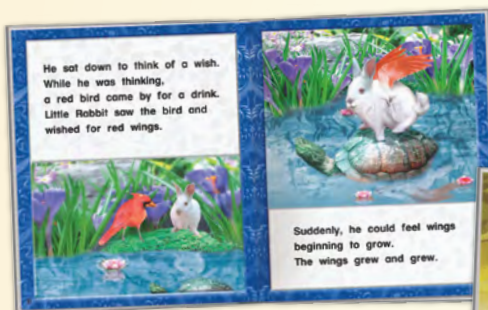
The Little Rabbit Who Wanted Red Wings