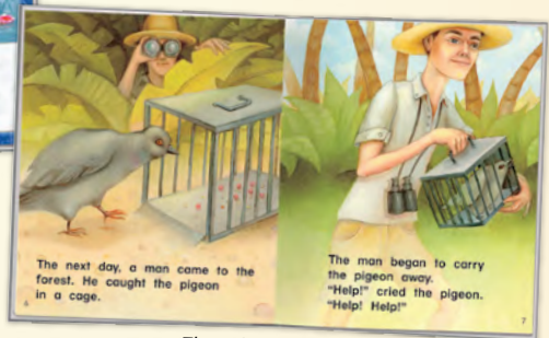
The Ant and the Pigeon