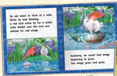
The Little Rabbit Who Wanted Red Wings