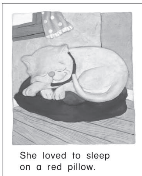
The Cat Who Loved Red © 1992 Seedling Publications

Consider the difference between reading word cards compared to reading the same words in a book.