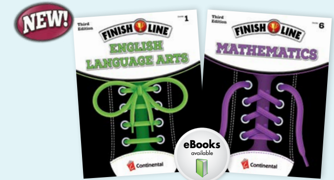
Finish Line, Third Edition