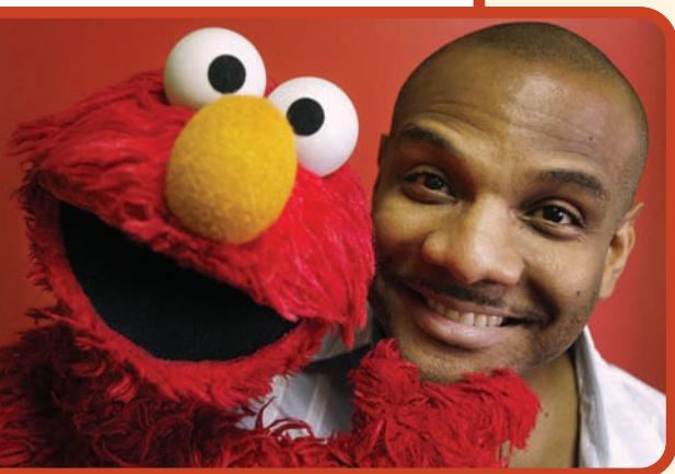
Kevin Clash with Elmo

On Sesame Street , Elmo is a three-year-old red, furry monster with a big orange nose. His trademark voice and high-pitched laugh make him instantly recognizable. In real life, puppeteer Kevin Clash brings Elmo to life. Thanks to the distinctive voice and warm personality Clash brings to his character, Elmo has become one of the most popular residents of Sesame Street .