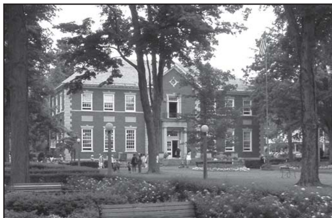
One of the main buildings at the present-day Chautauqua Institution.

4 By 1882, Chautauqua correspondence classes were available to anyone within reach of the U.S. mail. By 1900, at least 50 “daughter Chautauquas” had been founded in scenic areas around the country. More than 10,000 local Chautauqua reading circles had sprung up and, in 1904, lecturers and entertainers